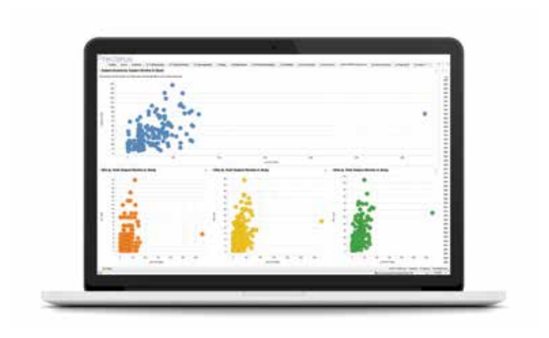
Intelligent. Agile. Transparent.

PPD's commitment to fostering new and disruptive ideas across the clinical development process and the solutions Preclarus offers can help you optimize your development process and propel your product toward the market with confidence.